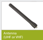
Antenna (UHF or VHF)