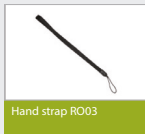
Hand strap RO03