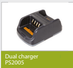
Dual charger PS2005