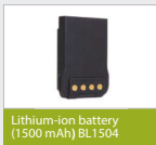
Lithium-ion battery (1500 mAh) BL1504