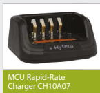
MCU Rapid-Rate Charger CH10A07