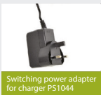
Switching power adapter for charger PS1044