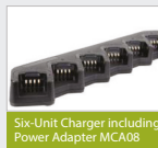
Six-Unit Charger including Power Adapter MCA08