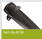
Belt clip BC08