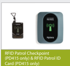
RFID Patrol Checkpoint (PD415 only) & RFID Patrol ID Card (PD415 only)