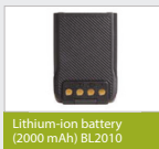
Lithium-ion battery (2000 mAh) BL2010